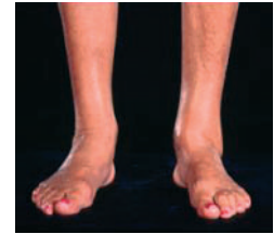
See p 460