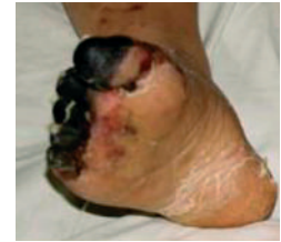
See p 459