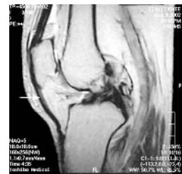
See p 213