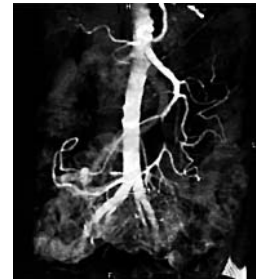
See p 211