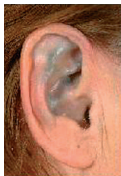
See p 130