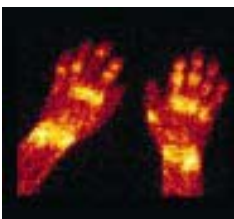
See p 825