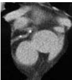
See p 846