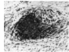
See p 472