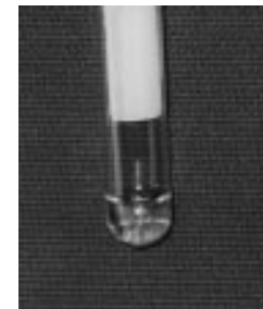
See p 491