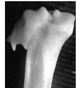
See p 1022