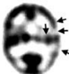
See p 774