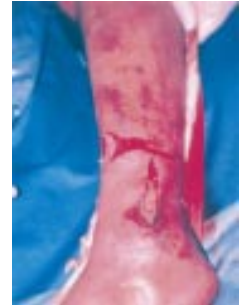
See p 848