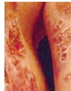
See p 850