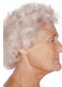
See p 590

For those who did not attend the June 2002 EULAR Conference, a CD-Rom containing the abstracts from this conference—EULAR 2002—is included with this issue (Ann Rheum Dis, Vol 61, Suppl 1, July 2002)