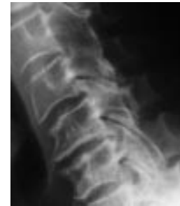
See p 650