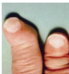
See p 298

TNF expression in a synovial membrane section from a patient with arthritid mutilans. See p 298