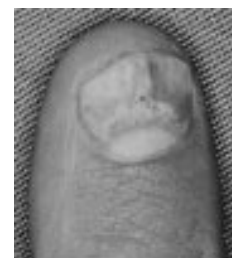
See p 277