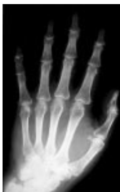
See p 219