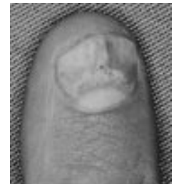
See p 277