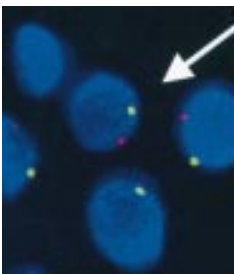
See p 1041