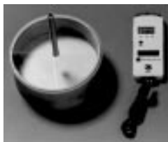
See p 1075