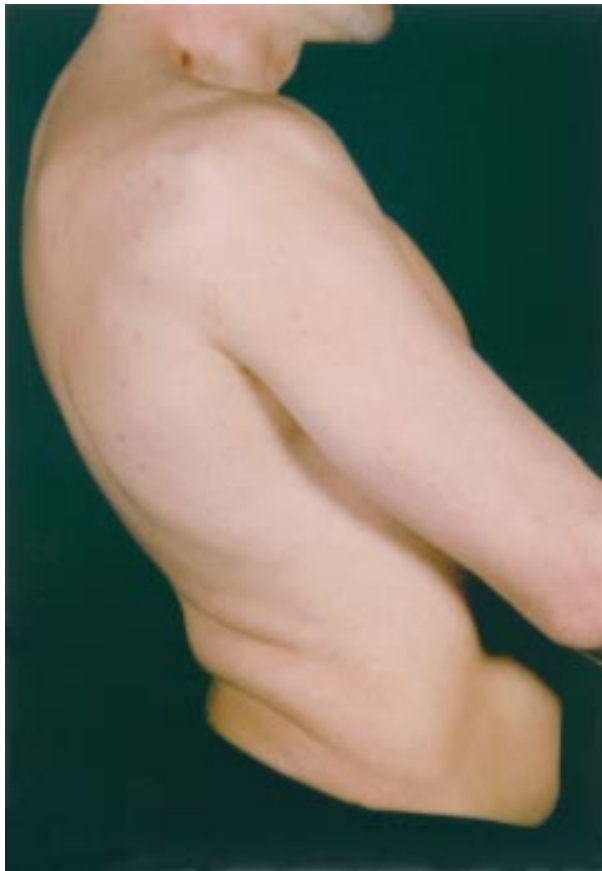
Figure 1 Patient with stiff man syndrome.