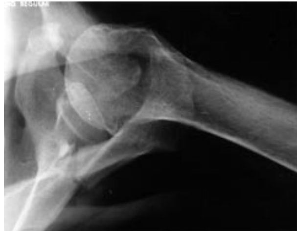
Figure 2 Axillary view of the right shoulder showing fracture of the base of the acromion.