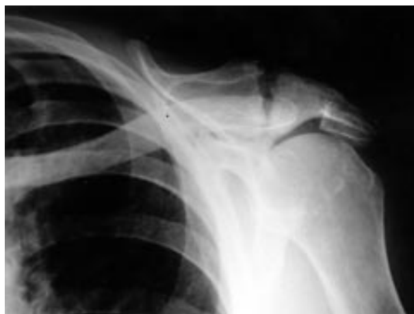
Figure 1 Anteroposterior view of the right shoulder showing fracture of the base of acromion.

Examination showed mild tenderness and crepitus at the base of the acromion where a fracture gap could be palpated. Active shoulder movements were restricted to 90° of both flexion and abduction. She also had a senile osteoporotic kyphosis of her thoracic spine. Anteroposterior and axillary radiographs of the shoulder showed a displaced fracture of the base of the acromion with superior subluxation of the head of the humerus, suggesting chronic rotator cuff tear arthropathy (figs 1 and 2). A radiograph of her spine confirmed the osteoporotic kyphosis of the thoracic vertebrae. Blood tests including full blood count, erythrocyte sedimentation rate (ESR), bone biochemistry, and myeloma screen were normal. She was treated conservatively in a broad arm sling with gradual mobilisation as her pain subsided. She recovered nearly full movements of her shoulder in four weeks. A follow up x ray examination at six months showed a non-union of the fracture, which was not painful.