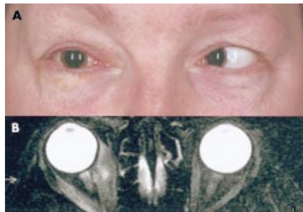
Figure 1 (A) The patient is asked to look to her right, demonstrating severe restriction of the right lateral rectus muscle. (B) T 2 weighted magnetic resonance scan of the orbits before treatment. This shows gross thickening of the extraocular muscles with a high signal, indicating oedema.

The MR scan showed no intracranial abnormality, but there was gross enlargement of the belly of the right medial rectus