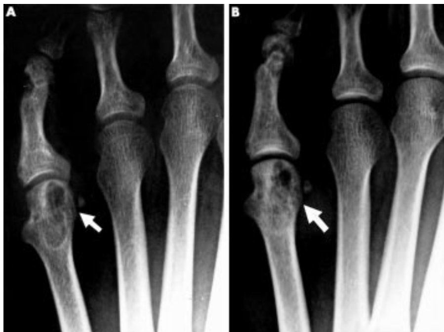
Figure 1 (A) November 1999. Active erosion in the right fifth proximal interphalangeal joint and a subchondral cyst in the fifth metatarsal head (arrow). (B) December 2000. Partial filling of the subchondral cyst, with nearly normal bone structure (arrow), progressive bone absorption of the erosion in the right fifth interphalangeal joint, and no new erosions. The metatarsophalangeal joint surface is regular, and the joint space is conserved.

Methotrexate was added to the treatment, but the patient developed fever and severe diarrhoea after the second dose. Methotrexate was stopped and leflunomide was started in January 2000. He received a three day initial loading dose of 100 mg/day followed by 20 mg daily doses.