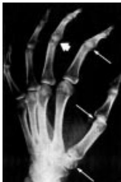
See p 895