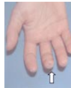
See p 937