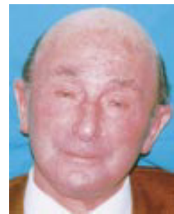
See p 59