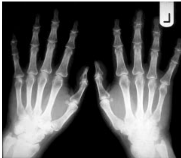
Figure 1 Radiograph of the hands of the male patient

of the two SPs presenting with a case of psoriatic arthritis. The study protocol for this case did not allow follow up visits.